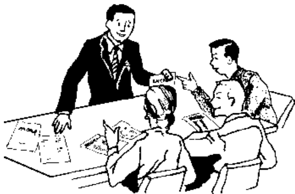
Figure 1: An example of interaction between people in a meeting

Consider a hypothetical scenario in which people are sitting around a conference table to have a meeting as shown in Figure 1. In the meeting, people are talking each other with gestures and facial expressions. The speakers gaze at listeners and visually monitor their environment. Likewise, listeners look at speakers. Listeners monitor speaker's facial expression and gestures, they nod their heads, change their facial expressions and physical postures depending on their interest in and attitude to the speaker's utterance. In this paper, we assume that the system knows the relative positions of participants. The system, therefore, can determine who is looking at whom by a person's gaze direction.