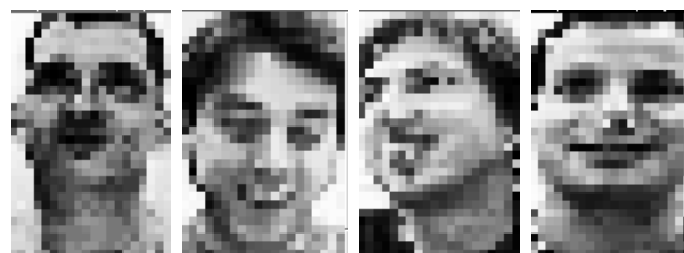
Figure 4: Resized and histogram normalized input images

The extracted faces are resized to a fixed size of 20x30 pixels. In order to compensate for different lighting conditions and to enhance contrast in the images, the resized face images are normalized by histogram normalization. These resized and histogram normalized face images are used as input to the neural net. Figures 4 show some sample input images.