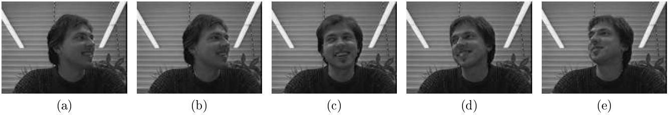
Figure 5: Rapid head movement and occlusion of eyes

set were around 3300 images, average number of frames in the test sets was around 650 images.