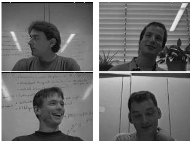
Figure 2: Sample frames from recorded video

asked to look at the others following a script. We have recorded and digitized video sequences of six speakers. Each of the sequences is around two to three minutes long. We then tried to automatically estimate in which direction the persons were looking in the video data. Because the 3D locations of the participants are assumed to be known in the experiment, we can then map the estimated gaze direction directly to the person whom the speaker was looking at (if he wasn't looking down on the table). Figures 2 show some sample images from the recordings.