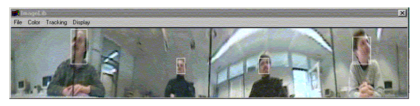
Figure 4: Panoramic view of the scene around the conference table. Faces are automatically detected and tracked (marked with boxes).