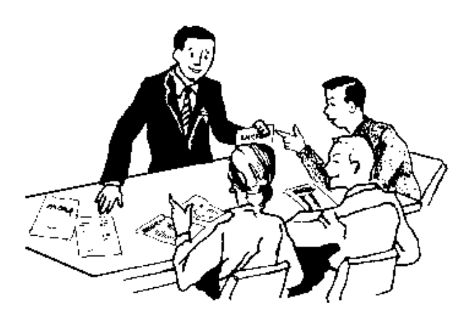
Figure 1: An example of interaction between people in a meeting

the relative positions of probable targets of interest in a room. In a meeting, as depicted in Figure 1, clearly the participants around the table are such likely targets. Other likely targets can be: documents on the table, a whiteboard or slide projections on a wall, or people entering the room. Therefore, our approach