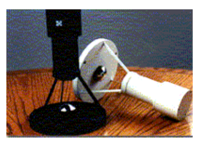
Figure 5: The panoramic camera used to capture the scene ^{1}

other participant at the table in our focus of attention model as described in section 2, it is necessary to determine the number and relative locations of participants that are apparent around the conference table.