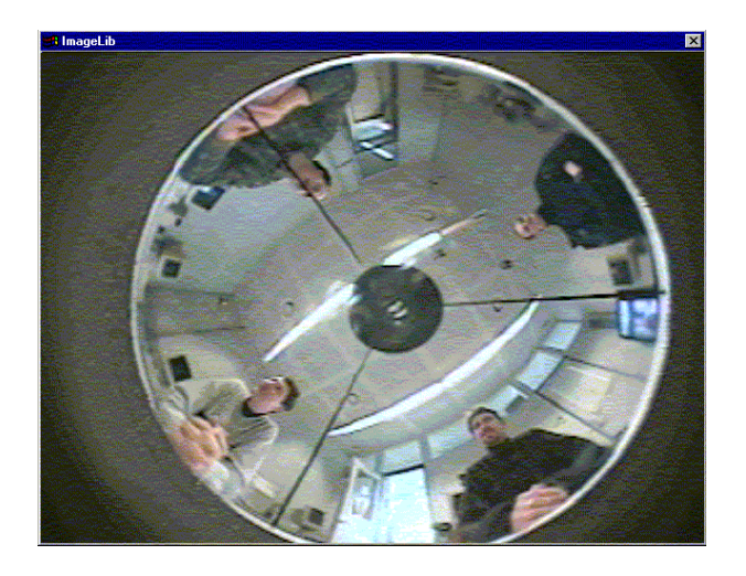
Figure 6: Meeting scene as captured with the panoramic camera

objects in the background of the scene that are not faces or hands. Only regions with a response from the color-classifier and some motion during a period of time are considered as faces.