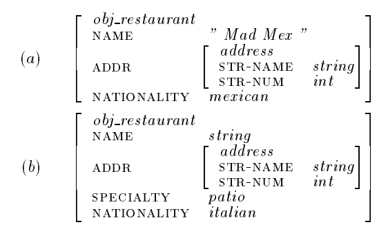
Figure 3: Two generalizations over subsets of the six restaurants: (a) shows the generalization over the restaurants carrying the name "Mad Mex", while (b) shows the generalization over the restaurants having a patio. The generalizations are deductible from the underspecified representations shown in figure 2 when restricting the represented feature structures to \{4,5\} and \{1,2\} respectively.