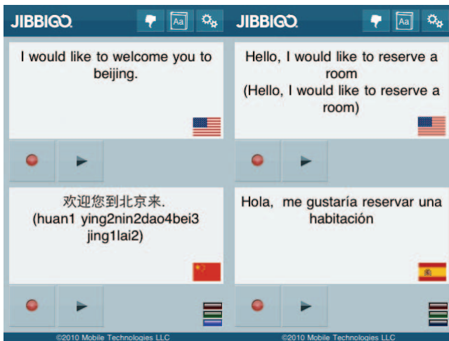
Figure 1: Jibbiggo Chinese-English and Spanish-English

Figure 1 shows screenshots of the Chinese-English and Spanish-English versions of Jibbiggo. In addition to the spoken output, the user can read the speech recognition output and translations.