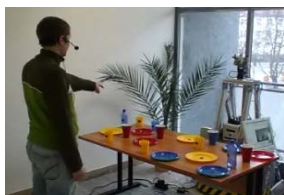
Figure 2: Experiment setup

The exemplary human-robot dialog interaction is installed within the context of the collaborative research center SFB588 at the University of Karlsruhe, developing cooperative and multimodal humanoid robots. In our particular scenario, our robot acts in the role of an early-stage bartender. Twenty objects, diverging in color, shape and location are placed on a table in front of the robot and represent the user’s order options. Before each dialog, our test subjects silently choose a particular item of interest from the table setting. Our robot then initiates a multimodal dialog with the goal to identify the user’s object of interest and serve the corresponding item. The robot’s dialog capabilities are mainly represented by its speech and gesture recognition system. Detailed information about the system’s conversational interface can be found in [5].