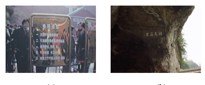
(a) (b) Figure 7 Difficult examples of sign detection

background. The sign in Figure 7(b) is embedded in the background