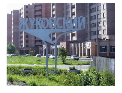
Figure 1 A sign embedded in the background