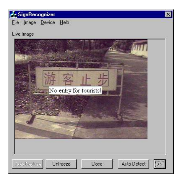
Figure 4 The interface of the prototype system

An efficient user interface is important to a user-centered system. Use of interaction is not only necessary for an interactive system, but also useful for an automatic system. A user can select a sign from multiple detected signs for translation, and get involved when automatic sign detection is wrong. Figure 4 is the interface of the system. The window of the interface displays the image from a video