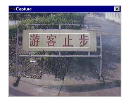
Figure 6 An example of false detection

Figure 7 illustrates two difficult examples of sign detection. The text in Figure 7(a) is easily confused with the reflective