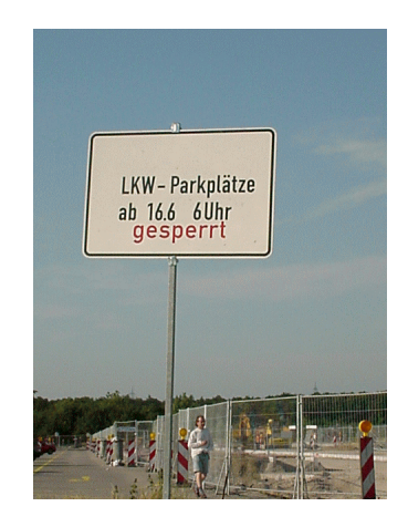
Figure 2 A German sign

Fully automatic extraction of signs from the environment is a challenging problem because signs are usually embedded in the environment. The related work includes video OCR and automatic text detection. Video OCR is used to capture text in the video images and recognize the text. Many video images contain text contents. Such text can come from computer-generated text that is overlaid on the imagery (e.g., captions in broadcast news programs) or text that appears as a part of the video scene itself (e.g., a sign outside a place of business, or a post). Location and recognition of text in video imagery is challenging due to low resolution of characters and complexity of background. Research in video OCR has mainly focused on locating the text in the image and preprocessing the text area for OCR [4][6][7][9][10]. Applications of the research include automatically identifying the contents of video imagery for video index [7][9], and capturing documents from paper source during reading and writing [10]. Compared to other video OCR tasks, sign extraction takes place in a more dynamic environment. The user's movement can cause unstable input images. Non-professional equipment can make the video input poorer than that of other video OCR tasks, such as detecting captions in broadcast news programs. In addition, sign extraction has to be implemented in real time using limited resources.