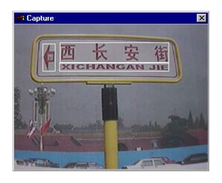
Figure 5 An example of automatic sign detection