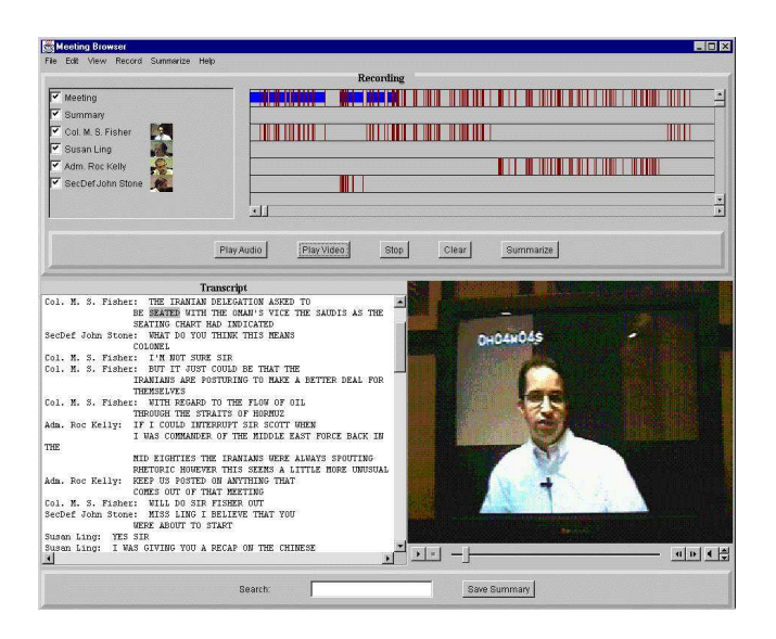
Figure 3: The meeting browser main window consists of three sections, an upper graphical display which shows the meeting over time, a lower left window that shows a meeting transcript, and a lower right window which displays either a video of the current meeting or a dialogue summary.

these may include annotations, comments or corrections. Corrections can be done by using a keyboard or handwriting recognition using a handwriting recognizer developed in our lab [9]. In the future we plan to add speech recognition as an additional error repair modality.