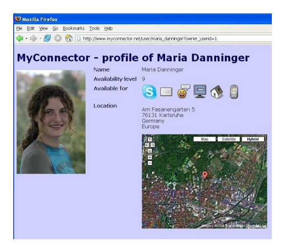
Fig. 4. Web interface showing a public profile.

to find appropriate default privacy settings for the Connector service. In this survey people were asked which details about their location and current activity they would like to broadcast to their wife/husband, family, friends, acquaintances, coworkers and their boss, during work time and free time. The time of day seemed to be only relevant for work-related persons (co-workers, boss). As expected, less known persons (such as acquaintances) were less trusted than people in more proximate social circles (such as family and friends).