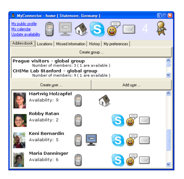
Fig. 3. Screenshot of the MyConnector Windows XP client.

standard phone via a voice dialogue system. By calling a person's (toll-free) Connector number, the call is routed through our telephone server. As the caller, once you identify yourself and the person you want to contact, the Connector service will inform you about the receiver's current availability; and then proceed to route or block the call, accordingly. This is the setup that was used and tested in the field studies described in section 3.