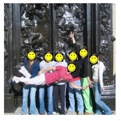
Fig. 1. Left: All possible faces in the Big Connector Studie's Guess-Who-Task, each team had to collect clues from team members to find their Mystery Person. Right: Group picture taken during the coordination task.

All studies were performed at Stanford University during the fall 2005 quarter, using roughly 100 college-aged students from mixed disciplines (social science, engineering, and humanities) from an introductory course in Communication. Evaluation of the collected data is work in progress. Initial results from the Availability Study indicate that participants with calendar appointments marked as busy or free did not significantly predict how available participants wree for communication according to the in-the-moment availability as measured by pings from the server. This supports the claim that there is a problem with calendaring information, which could be framed as planned (scheduled in calendar) availability as being very different from situated (in-the-moment) availability. Therefore, we conclude that calendar information alone is not sufficient to estimate availability for communication.