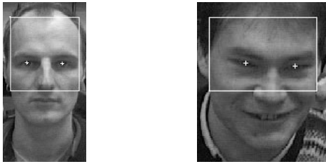
Figure 3. Search area for eyes

Figure 3 shows the search windows for the eyes and found eyes for two faces.