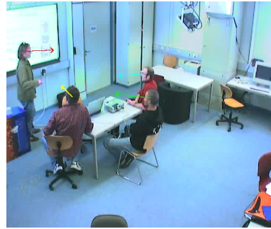
Figure 5. Example camera view with automatically estimated head orientations (from [38]).

Finally, an approach for joint tracking and pose estimation was investigated [32]. Here, both 2D body position and velocity, as well as horizontal and vertical head orientation are jointly estimated in a Bayesian approach. In every frame step, a hypothesized body position is updated along its corresponding velocity component according to the time elapsed between these two frames. For accounting uncertainty and ambiguity, a particle filter allows to propagate numerous hypotheses (particles), and low-dimensional shape and appearance models (color histograms) for different body parts are used to compute each hypothesis' likelihood. Such an integrated approach might provide for faster systems, as