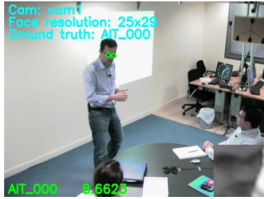
Figure 3. Example screenshot of a face identification system running on Interactive Seminar data (Image taken from [18]). In the bottom right corner the extracted face is shown.

are determined according to the separation of the best two matches. Some systems also combine different feature extraction methods [46, 47].