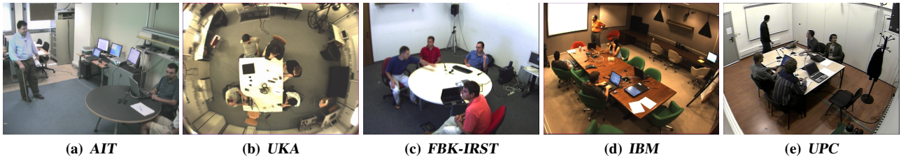
Figure 1. Scenes from the five smart rooms apparent in the 2007 CHIL Interactive Seminar database

event detection. In January 2005, the first formal evaluations were then conducted, which now also included multimodal evaluation tasks (multimodal tracking, multimodal identification). Also, these evaluations were made open to external participants.