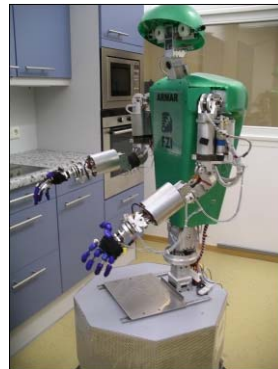
Fig. 1. Humanoid robot in the robot kitchen at the SFB 588 lab in Karlsruhe

Abstract —Future life pictures humans having intelligent humanoid robotic systems taking part in their everyday life. Thus researchers strive to supply robots with an adequate artificial intelligence in order to achieve a natural and intuitive interaction between human being and robotic system. Within the German Humanoid Project we focus on learning and cooperating multimodal robotic systems. In this paper we present a first cognitive architecture for our humanoid robot: The architecture is a mixture of a hierarchical three-layered form on the one hand and a composition of behaviour-specific modules on the other hand. Perception, learning, planning of actions, motor control, and human-like communication play an important role in the robotic system and are embedded step by step in our architecture.