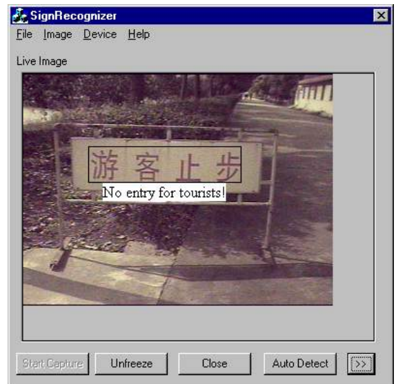
Figure 4 The interface of the prototype system

An efficient user interface is important to a user-centered system. Use of interaction is not only necessary for an interactive system, but also useful for an automatic system. A user can select a sign from multiple detected signs for translation, and get involved when automatic sign detection is wrong. Figure 4 is the interface of the system. The window of the interface displays the image from a video