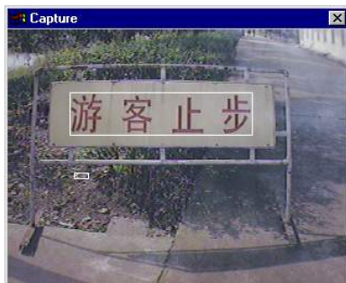
Figure 6 An example of false detection

Figure 7 illustrates two difficult examples of sign detection. The text in Figure 7(a) is easily confused with the reflective