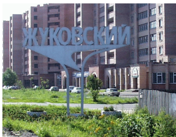
Figure 1 A sign embedded in the background