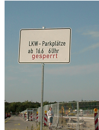
Figure 2 A German sign

Fully automatic extraction of signs from the environment is a challenging problem because signs are usually embedded in the environment. The related work includes video OCR and automatic text detection. Video OCR is used to capture text in the video images and recognize the text. Many video images contain text contents. Such text can come from computer-generated text that is overlaid on the imagery (e.g., captions in broadcast news programs) or text that appears as a part of the video scene itself (e.g., a sign outside a place of business, or a post). Location and recognition of text in video imagery is challenging due to low resolution of characters and complexity of background. Research in video OCR has mainly focused on locating the text in the image and preprocessing the text area for OCR [4][6][7][9][10]. Applications of the research include automatically identifying the contents of video imagery for video index [7][9], and capturing documents from paper source during reading and writing [10]. Compared to other video OCR tasks, sign extraction takes place in a more dynamic environment. The user's movement can cause unstable input images. Non-professional equipment can make the video input poorer than that of other video OCR tasks, such as detecting captions in broadcast news programs. In addition, sign extraction has to be implemented in real time using limited resources.