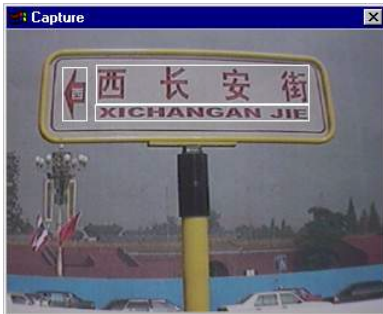
Figure 5 An example of automatic sign detection