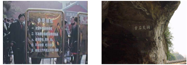
Figure 7 Difficult examples of sign detection

background. The sign in Figure 7(b) is embedded in the background